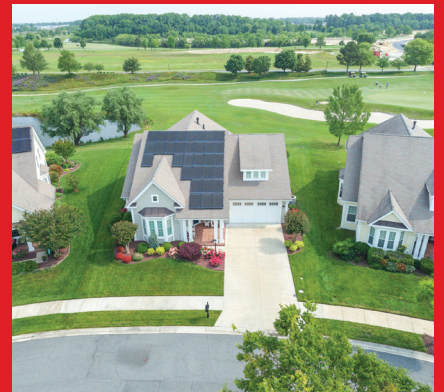
Bridgeville, DE Heritage Shores MLS# DESU2041962 Agent- Pam Price